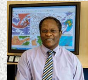
Director of Meteorological Studies and Weather Center at Western Connecticut State University